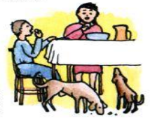
Dot to dot: dogs. Fill-in-the-Blanks: just, revealed, Lord, servants, keep, sabbath, mountain, prayer, altar, house. ALL PEOPLES.

Jesus wasn't trying to make the woman give up. He was giving her a chance to show how much humility and faith she had. Jesus used this to show the people that God will let anyone who believes, like this woman, become part of His chosen people.