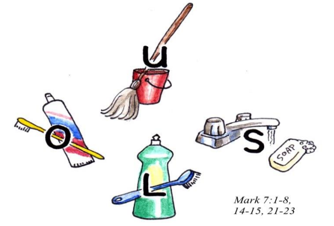
Mark 7:1-8, 14-15, 21-23

The Jews knew that it was important to keep their bodies and their dishes clean. But Jesus told them that something else was more important. What was it?