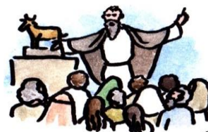
Joshua 24:1-2, 15-18

In today's first reading, Joshua told the people that they had to choose between the false gods and the true God. Joshua and the people chose to worship the true God.